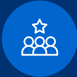
Retain top talent

Employers who wish to meet the following business objectives: