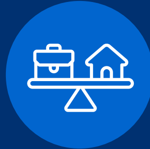
Promote work-life integration

Employees who meet the following criteria: